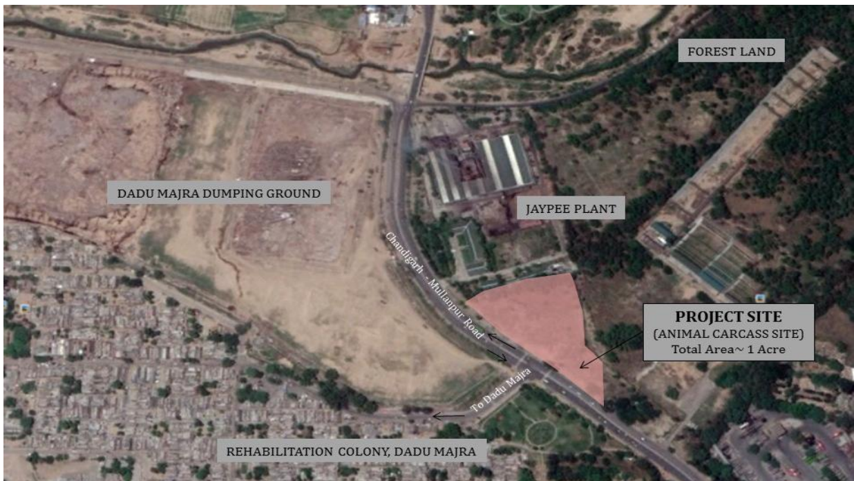
Aerial View of Project Site